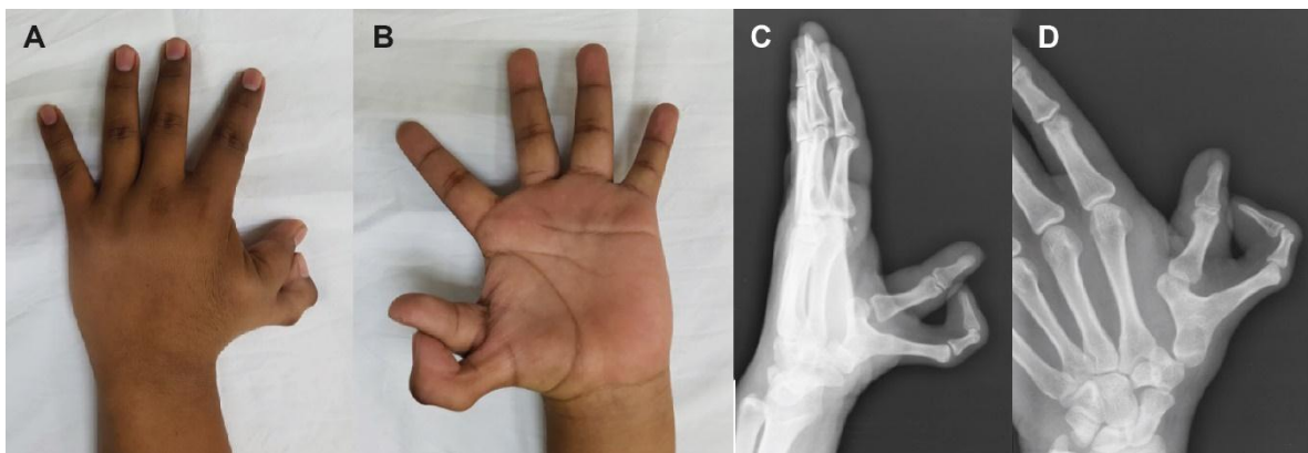
Figure 1: Pre-axial polydactyly of left hand. (A) dorsal view; (B) Palmar view; (C) lateral X-ray projection; (D) posterior-anterior X-ray projection.

An 18 year-old man is evaluated for polydactyly of the left thumb. Patient denies familiar history of previous polydactyly cases or any other important malformation and syndromes. The patient has a history of strabismus, operated during youth and was born from a teen-pregnancy. Denies any other important medical history. On physical examination, a pre-axial polydactyly of the left hand is identified (Figure 1). The pre-axial thumb is in a non-functional flexion, with forced movement at the interphalangeal and metacarpophalangeal joints. Metacarpal base without movement. Medial thumb with normal function. X-ray of hand in 2 positions reveals a "T" shape bone extension from the middle of the 1 st metacarpus, giving origin to the pre-axial polydactyly (Figure 1). Carpometacarpal joint without evident pathological data. Metacarpophalangeal joint of functional thumb with slight dislocation or increased space, without clinical symptoms.