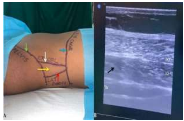
Figure 2: A) Triangle of Petit (yellow arrow), bounded by External oblique muscle (white arrow), Lattismus dorsi muscle (red arrow), iliac crest (green arrow) and subcostal margin (blue arrow) and B) Ultrasound picture of the abdominal wall showing External oblique muscle (EO), Internal oblique muscle (IO), Transversus abdominis muscle (TA), with a needle tract (black arrow).

Thirty-nine patients were enrolled; 19 were randomized to the TAP block group and 20 to the control group. We compared age, sex, BMI, the need for conversion to an open procedure, the ASA class of the patients, and duration of surgery in both the groups. None of these factors were significant in the groups (Table 1).