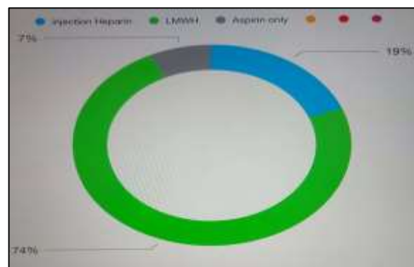
Figure 1: Pre-op anticoagulant administration.

The 42 out of 75 patients were started on some form of anticoagulant or anti platelet therapy at primary care level before presenting to emergency room.