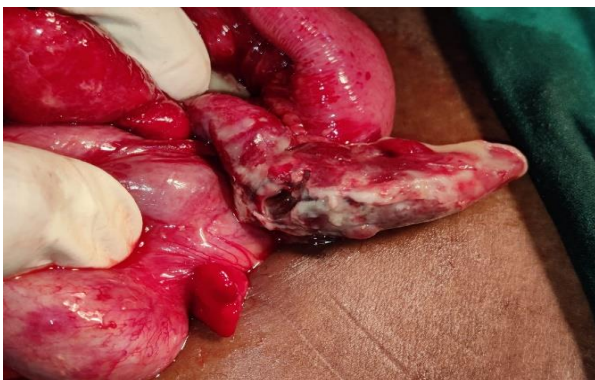
Figure 2: Intraoperative picture showing appendicular perforation.