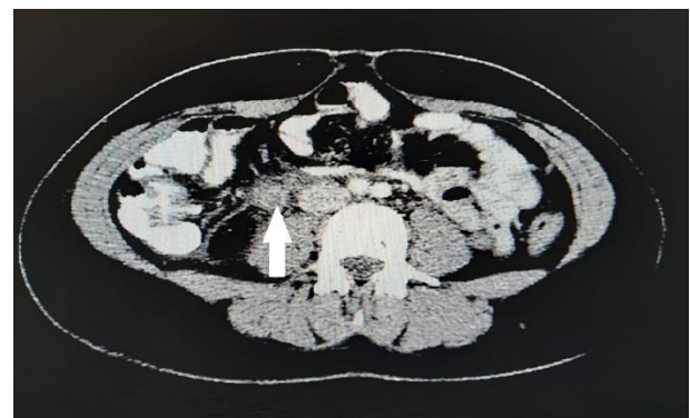
Figure 2: CT Angiography showing a thrombus in the right ovarian vein.

The patient underwent an appendectomy for acute appendicitis. Six hours after surgery, anticoagulation therapy was started, initially with subcutaneous LMW-heparin 2000 IU subcutaneously once a day for 10 days bridged to Warfarin for one month with standard monitoring of APTT and INR in between the range of 2-3. Patient was managed by a multidisciplinary team approach involving general surgeons, gynecologists, and hematologists. On the 2 nd month of follow-up, CT abdomen revealed complete resolution of OVT.