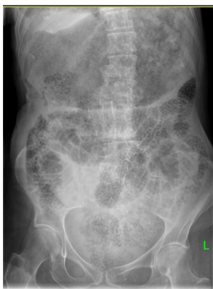
Figure 1: X-ray abdomen.

Foreign body bezoar with styrofoam has never been reported in literature and to best of our knowledge, this is first reported case of 'styrofoam bezoar' presentation.