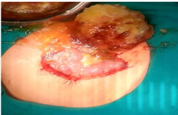
Figure 1: Appendicular mass- an intraoperative image.

The tumour markers CA 19-9 and CA 125 were within normal limits; however, CEA was slightly raised (8.06 µg/l).