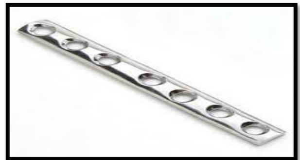
Figure 4: Fibular plate.