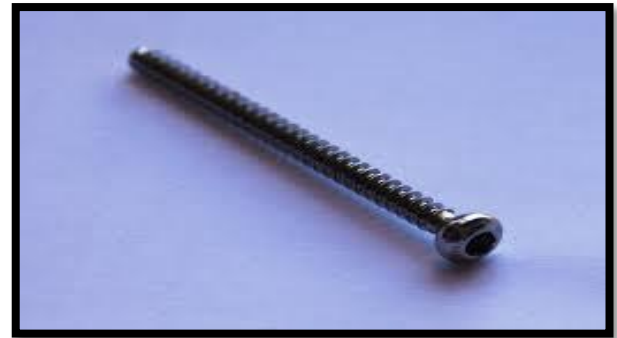
Figure 3: syndesmotoc screw.

There was loss of reduction in two [04%] due to premature weight bearing with breakage of the screws. A total of 04 [08%] reported infection [superficial infection 03(06%) {deep infection 01(02%)}. The patients with superficial infection were put on suitable intravenous antibiotics for six weeks after getting the culture and sensitivity report and it was resolved eventually. The deep infection was associated with the exposure of the implant which was removed, with thorough debridement, irrigation and local application of platelet rich plasma augmented with vacuum assisted closure of the wound with suitable intravenous antibiotics for six weeks after getting the culture and sensitivity report with continuation of immobilization. There was loosening of screws in two elderly females [>65 years] with poor bone stock due to post-menopausal osteoporosis. Persistent pain after surgery was reported in 05 [10%] of the cases out which 02 [04%] had severe pain on weight bearing and underwent for ankle arthrodesis to get rid of their pain. Only 02 [04%] of the cases reported symptomatic hardware for which no active intervention but reassurance was given to the patient.