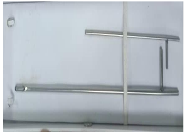
Figure 2: Mohan's urethral valvotome.

Follow up review 9 days after surgery revealed marked improvement in the urine stream with remarkably improved appetite and weight gain. Kidney function test done revealed potassium of 3.1 mmol/l, creatinine of 196 \mu\text{mol}/l and urea of 5.7 mmol/l. Urinalysis done was normal. He was planned for ultrasound evaluation of residual urine volume and uroflowmetry on next follow up visit.