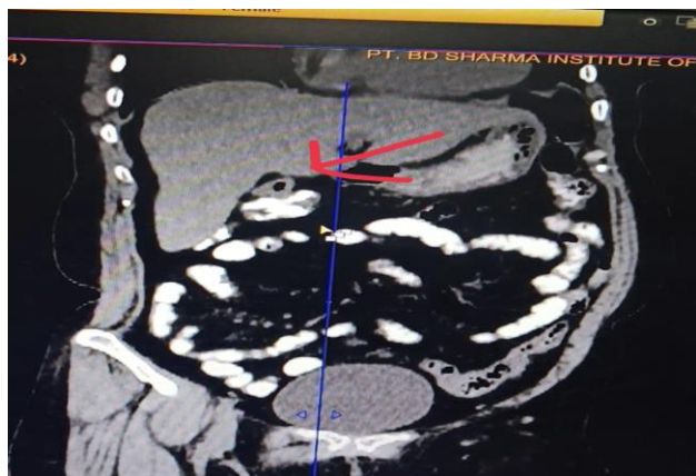
Figure 1: CECT showing air in gallbladder and outpouching abutting colon.

course was uneventful and the patient was discharged on postoperative day 8.