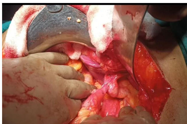
Figure 2: Intraoperative photo of cholecystocolonic fistula.