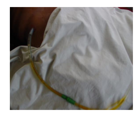
Figure 1: Post cholecystectomy bile leak through intra-abdominal drain.

The healing of BDI occurs by the process of fibrosis and scar formation. Scar contracture leads to formation of biliary stricture, the patient presenting with painless progressive obstructive jaundice. About 30-60% of the BDIs will develop strictures requiring intervention.