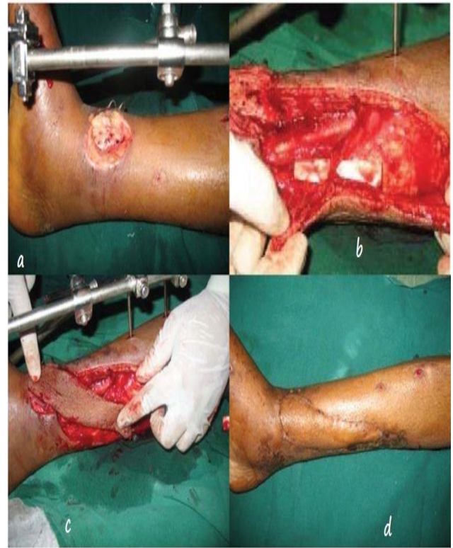
Figure 3 (A-D): PNAP flap for coverage of exposed tibia.

First incision was made at one side of the marked flap retracted to locate the marked perforators. A subfascial approach was made to visualize the pedicle.