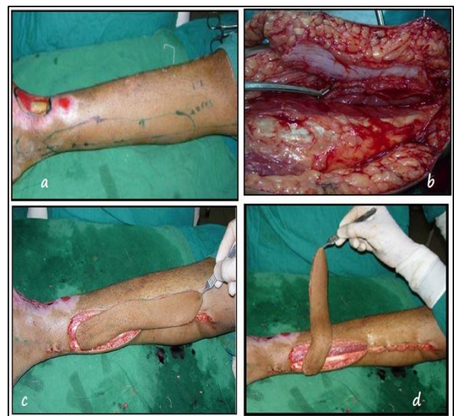
Figure 1 (A-D): A defect in the lower one third of leg, distally based PTAP flap marked with two perforators marked (x) adjacent to the defect with a hand-held Doppler; PTA perforator is shown with peri perforator dissection; PTAP flap islanded on the perforator is shown; PTAP flap rotated 160^\circ in counter clock wise.

The propeller flap is identified as a local island fasciocutaneous flap based on a single dissected perforator. It has a design similar that of a propeller with 2 blades of unequal length with the perforator forming the pivot point so that when the blades are switched, the long arm comfortably fills in the defect. The flap has an ability to rotate any angle up to 180^\circ . A proximally based fasciocutaneous flap is unable to get enough healthy tissue into the defect and it tends to expose either the subcutaneous border of the tibia or the Achilles tendon. The propeller flap avoids these problems. In doing so it simultaneously transfers the secondary defect to an easily graftable area over proximal muscle bellies (Figure 1).