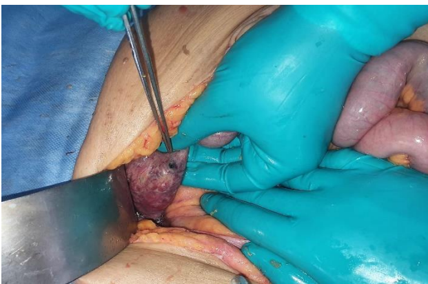
Figure 2: Perforation of the urinary bladder.