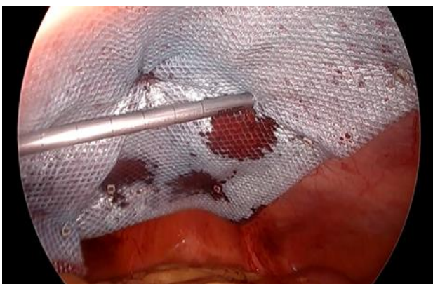
Figure 3: Intraoperative picture showing mesh fixation with tacks using laparoscopy tacker.