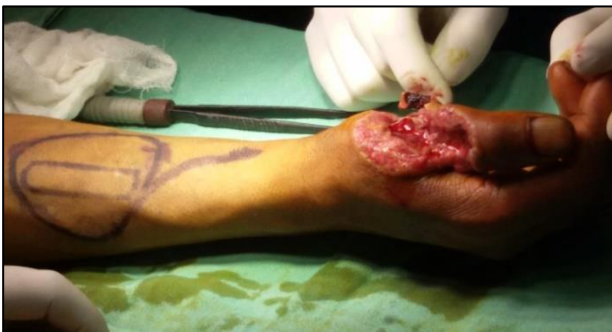
Figure 3: Intraoperative of preoperative marking for the flap.