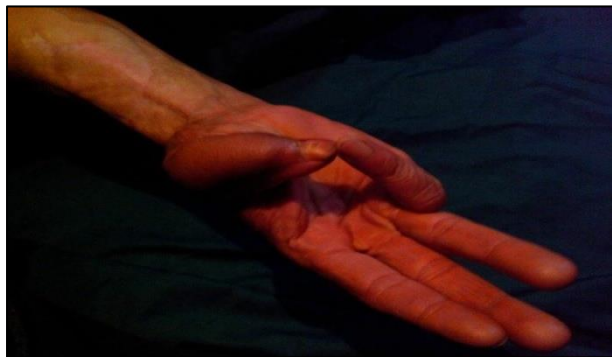
Figure 10: Post-operative picture demonstrating opposition of thumb.