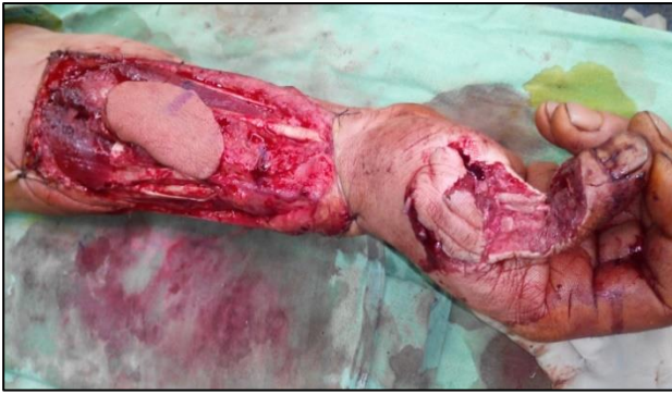
Figure 8: Intraoperative picture of flap dissection.