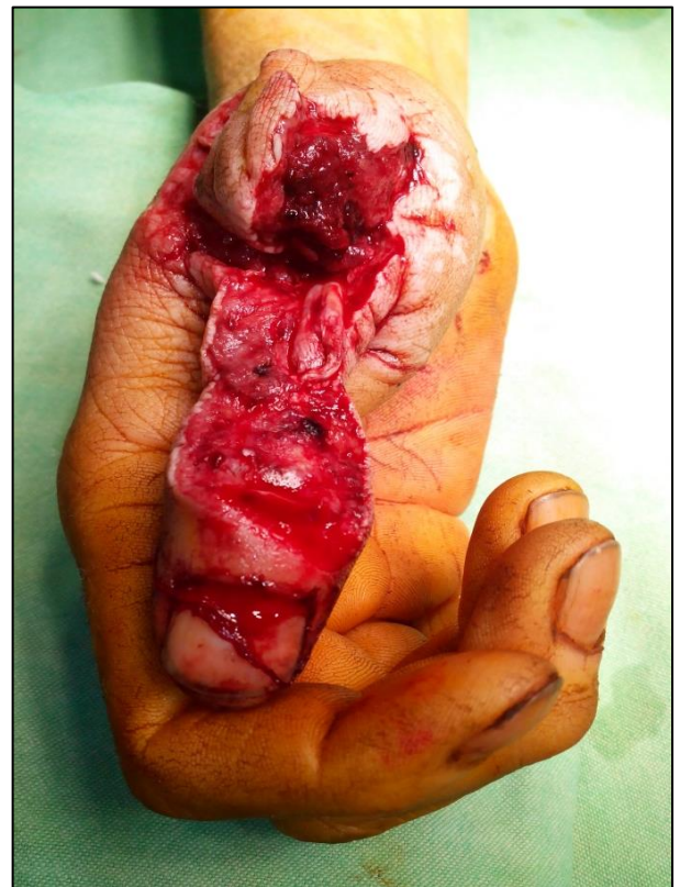
Figure 6: Traumatic defect of thumb.