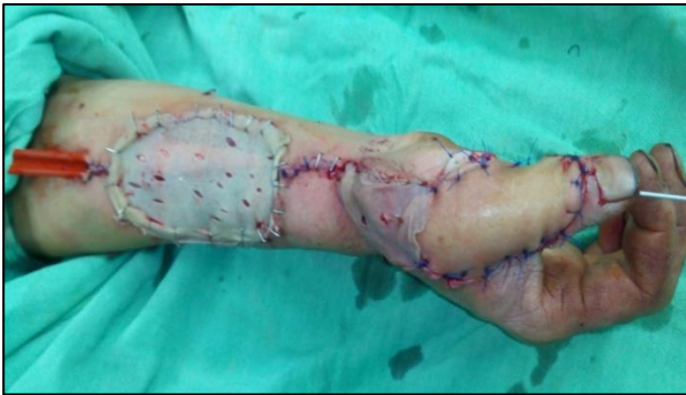
Figure 9: Immediate Post-operative picture of the patient, fixation by K-wire.