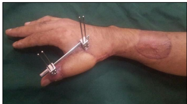
Figure 4: Post-operative picture of the patient with well settled flap and bone held by external fixator.