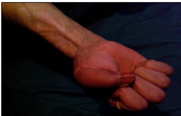
Figure 11: Picture demonstrating power grip.