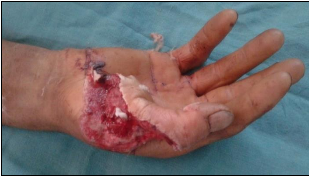
Figure 1: Planner injury with bony defect of thumb.