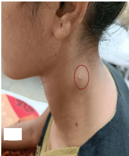
Figure 1: Isolated enlarged lymphnode of level VI group with no palpable thyroid swelling.

Histopathological examination (Figure 4) showed papillary thyroid carcinoma, pT2N1bMx tumor, with Extrathyroidal extension present, with microscopic strap muscle invasion. Patient is to be followed up with radioiodine uptake scan after 6 weeks with thyroxine supplementation and regular follow up.