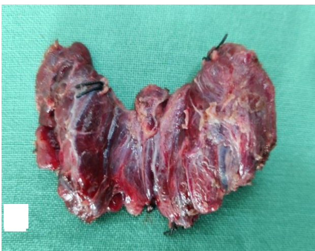
Figure 2: Specimen of total thyroidectomy.