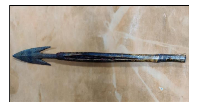
Figure 4: Removed arrow head.

Contrast Enhanced CT (CECT) Scan of abdomen shows, a metallic foreign body seen at right upper abdominal cavity with the arrow head present in the left lobe of liver through its anterior surface. No blood or any fluid seen in the peritoneal cavity.