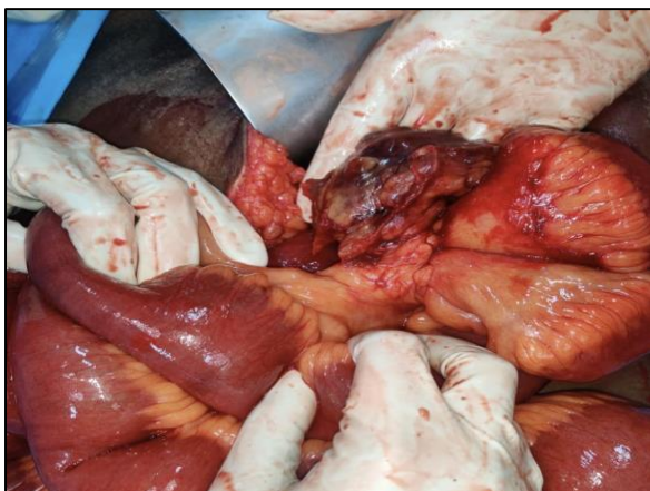
Figure 2: Giant torsed MD attached to ileal mesentery with transition point at mid ileum.

He did not have any previous history of similar episodes, surgery, tuberculosis or medical illness. His vitals were stable and per abdomen examination revealed distension, tenderness in right hypochondrium and absent bowel sounds. Erect X-ray abdomen showed multiple air fluid