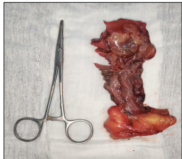
Figure 4: Giant gangrenous Meckel's Diverticulum measuring 12.5 cm.