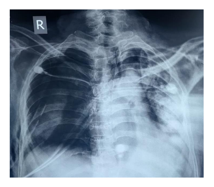
Figure 2: Chest X-ray of persistent right sided pneumothorax with mediastinal shift towards the left side. Note the surgical emphysema at the site of chest tube insertion.

However, a week later, the patient developed complaints of sudden onset right-sided chest pain with breathlessness. On examination, he was found to be tachypneic with reduced air entry on the right side of the chest. An urgent bedside chest X-ray revealed a large right-sided pneumothorax with collapse of the underlying lung, with mediastinal shift towards the left side. A 30-French size chest tube (ICD) was inserted bedside by the surgical team. Post-ICD insertion chest film showed a persistent right pneumothorax with surgical emphysema at the site of chest tube insertion (Figure 2).