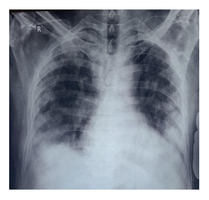
Figure 1: Initial chest X-ray of bilateral pneumonitis.

oxygen (SpO<sub>2</sub>) of 77% on room air. Respiratory examination revealed crepitations in bilateral lung fields. Chest X-ray revealed bilateral pneumonitis suggestive of viral pneumonia (Figure 1).