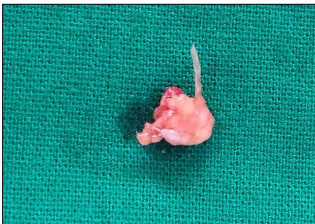
Figure 2: The mass removed en block.