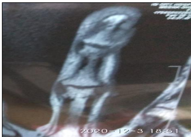
Figure 1: MRI mass with intense high signal on T2 image.

for biopsy (Figure 2) and report was consistent with the diagnosis of Glomus tumour (Figure 3).