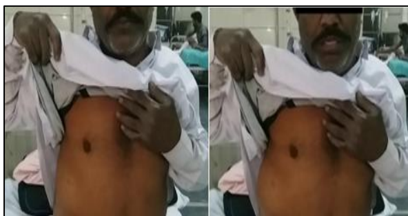
Figure 1: Chest wall swelling before and after coughing.

A chest radiograph was advised which revealed nothing even on Valsalva manoeuvre. Thus, CT scan of thorax was done and it diagnosed it as intercostal herniation. The patient was advised surgery and intraoperatively it was found that he has developed herniation of pleura between 8th and 9th ribs which was intact. with defect size 3×4 cms.