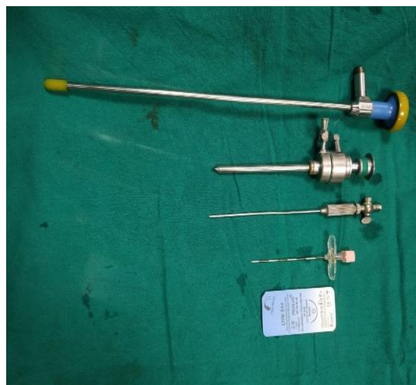
Figure 1: Instruments (Below to upwards). Prolene 2-0, 18G-Touhy needle, Veress needle, 5 mm laparoscopic trocar and 5 mm laparoscopic camera.

Group B: Conventional open herniotomy performed.