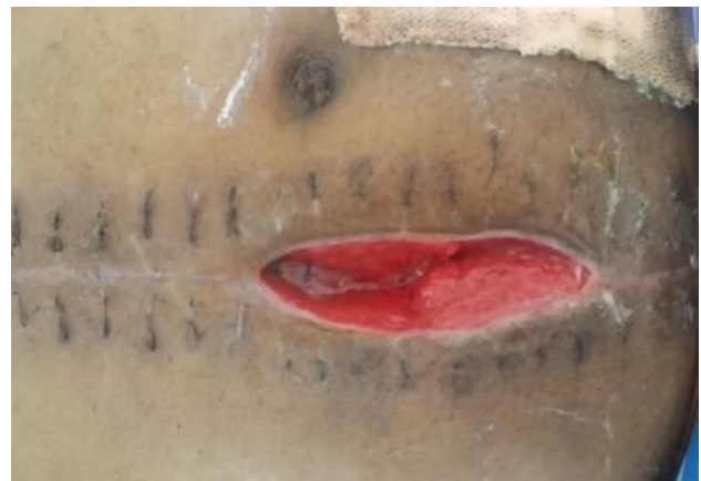
Figure 5: Wound in healing phase.