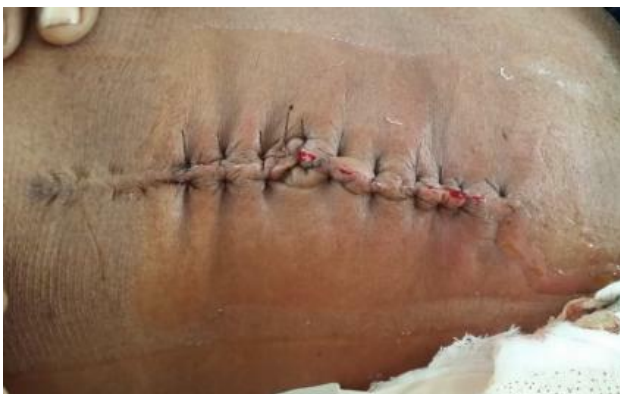
Figure 3: Infected post operative wound with pus discharge.