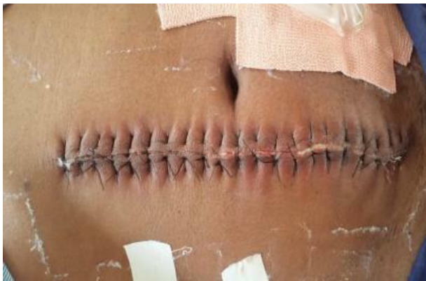
Figure 2: Infected post operative wound.

Authors have taken 2N number of cases, that was 400.