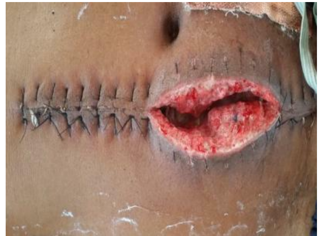
Figure 4: Wound after suture removal.

Patients lost to follow up, patients not giving consent to be part of the research, patients with incidental intra/post operative findings of additional pathology, patients who were unable to receive sensitive antibiotics and patients with predominant symptoms related to GI pathology not undergoing surgery were excluded from the study.