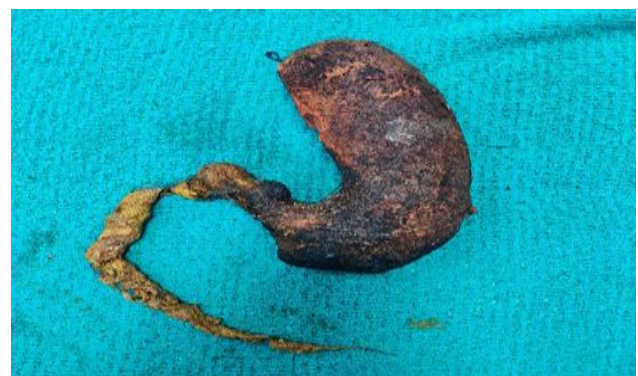
Figure 4: The extracted trichobezoar with the long tail which reached up to the proximal jejunum.