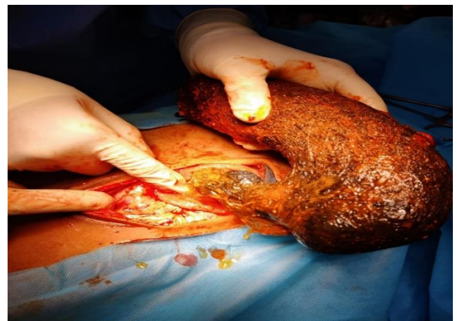
Figure 3: Intra-operative photograph of extraction of the huge trichobezoar through the gastrotomy incision.