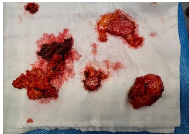
Figure 4: Four cysts removed from the liver, omentum, abdominal wall and the perinephric regions.