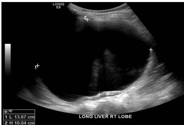
Figure 1: Abdominal ultrasonography of a large simple cyst.

Three years later, she re-presented with similar symptoms. Echinococcus antibody levels notably increased from 80-160 (previous admission) to 2560. She underwent exploratory laparotomy and resection of hydatid cyst deposits, during which four cysts were removed from the liver, omentum, abdominal wall and perinephric regions (Figure 4). Her recovery was uneventful, and she was discharged on several months of albendazole.