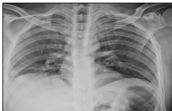
Figure 1: Chest X-ray not showing any evidence of pneumoperitoneum or pneumomediastium.

patient had a pulse rate of 130 beats per minute and a respiratory rate of 28 cycles per minute. The abdomen was distended, with diffuse tenderness, guarding, and rigidity. Bowel sounds were absent.