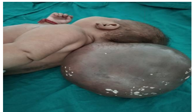
Figure 1: A large occipital encephalocele.

The patients excluded from the study were: all those with encephaloceles who did not undergo surgical repair; and those with encephaloceles but were not operated within the study period.