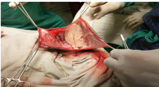
Figure 4: Identification of the sac.