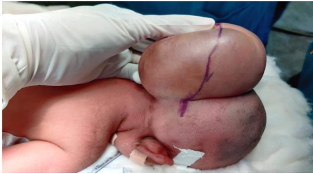
Figure 3: Position of the head in the surgery of occipital encephalocele.

Common complications of these surgeries are hydrocephalus, hemorrhage, infections (wound infection, meningitis) and while ablation of occipital lobes in posterior encephaloceles almost inevitably leads to blindness, with subsequent neurological deficit or seizures.