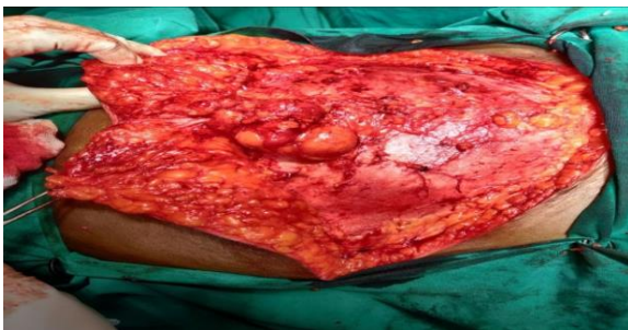
Figure 2: Dissecting the flap till the umbilicus showing the large sac with omentum as content.