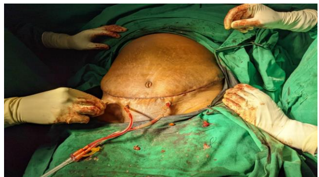
Figure 7: Skin is closed with subcuticular suture after placing a drain.