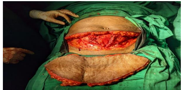
Figure 6: The abdominal flap is advanced inferiorly and tailored to remove the excess skin and underlying fat.