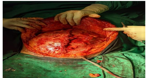
Figure 5: Closure of anterior rectus sheath and placement of drain.