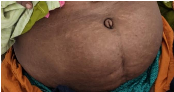
Figure 1: Pre-operative front view of a 39-year-old lady.

The duration of follow-up was done for 1 year to assess the contour of abdomen and post-operative complications. Recurrence was not seen in 90% of cases.