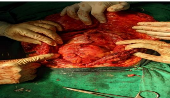
Figure 3: Rectorectus plane created for placement of mesh.