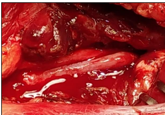
Figure 4: Revascularisation using reversed great saphenous vein graft.

Echocardiography revealed a vegetation 15×9 mm on anterior mitral leaflet and CT brain showed subacute