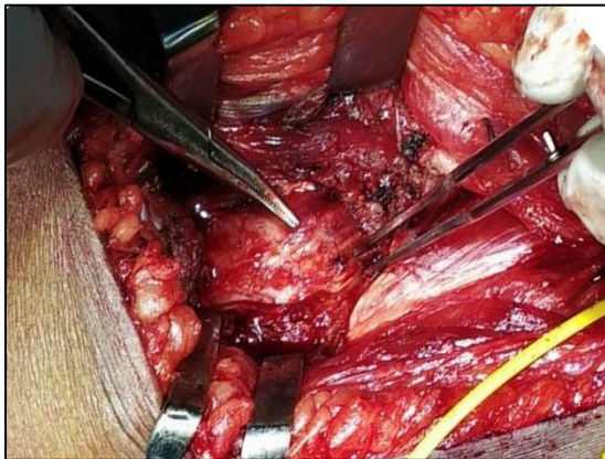
Figure 3: Intraoperative picture of the aneurysm.