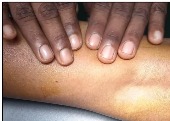
Figure 1: Pulsatile swelling due to popliteal aneurysm.

of Medical Sciences, a tertiary care hospital in central Kerala with right hemiparesis.