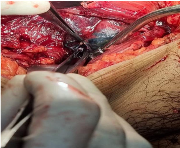
Figure 1: Methylene blue dye drained out from perforation site at the right lateral wall of extraperitoneal portion of the urinary bladder; thin segment of right lateral bladder wall raised possibility of a perforated bladder diverticulum.

was soft, tender over suprapubic region. Renal punch was negative. DRE prostate 4FB, median sulcus felt, no nodularity felt. 3 ways CBD was inserted and drained frank hematuria and thereby he was treated as hematuria secondary to BPH to rule out prostate carcinoma and started on bladder irrigation. In the ward, he had frequent episodes of clot retention and required frequent manual flushing. On day 2 of admission, patient developed hypotensive episodes and transiently responded to fluid resuscitation and eventually inotrope initiated. Serial ECG revealed no acute ischemic changes, cardiac enzyme was 155. Case referred to medical team and treated as anemia induced acute coronary syndrome.