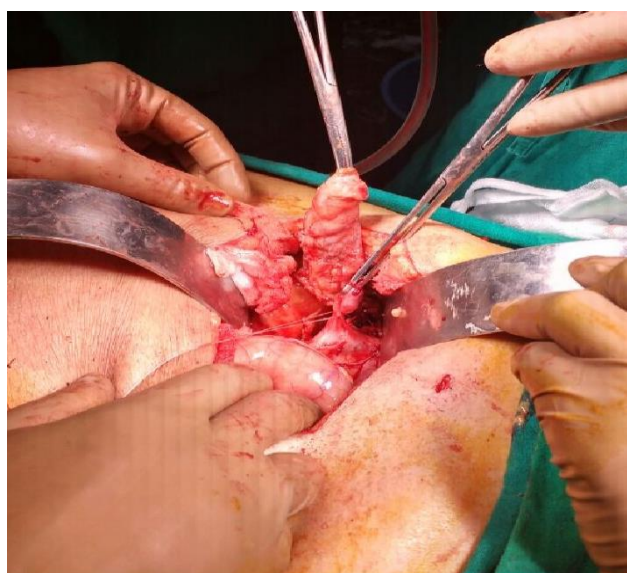
Figure 2: Conversion to open cholecystectomy.

The closure of 10 mm ports with 1-0 or 2-0 absorbable, synthetic, braided polyglactin 910 sutures (Vicryl) and