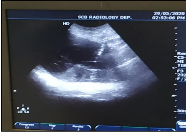
Figure 4: PCN tube with metallic tip is advanced under vision.

Step 6: PCN tube with needle was inserted and advanced upto Renal pelvis under real time USG guidance. (Figure 4)