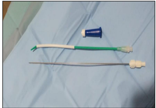
Figure 1: PCN Pigtail catheter with metallic tip and connector.

Step 4: A small incision of about 1cm given over puncture site and extended upto muscle.