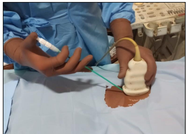
Figure 3: Placement of USG probe and PCN tube with needle insertion.