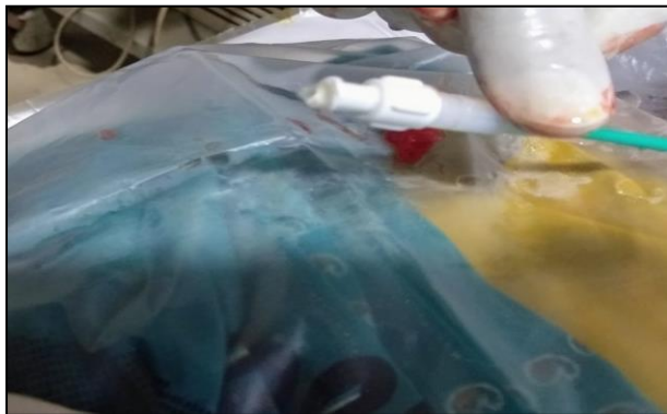
Figure 5: Free flow of urine.

Step 7: After confirmation of the tip in pelvis inner cannula was removed, free flow of urine was noted from catheter for confirmation. (Figure 5)