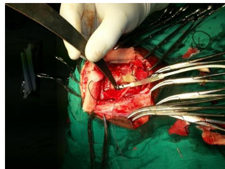
Figure 3: Operative photograph shows shunt chamber being taken out from lateral ventricle.

Subsequently, the patient was again posted for surgery for removal of left sided intraventricular shunt. A small left parietal craniotomy was done around the previous burr hole. Dura was opened to reveal yellowish colored subdural fluid and septations; the lateral ventricle also had septations, which were carefully cut. There were septations in ventricle around the shunt with fluid collections and the tip of shunt was adhered to choroid plexus. Careful dissection and coagulation were used to free the end and after ensuring complete haemostasis, the wound was closed (Figure 3). Patient recovered well and has been followed up for 1 year till the writing of this report.