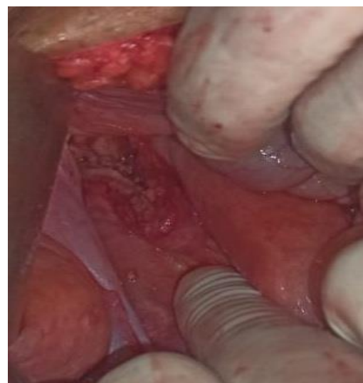
Figure 4: A 4×2 cm size perforation in anterior surface of rectum.