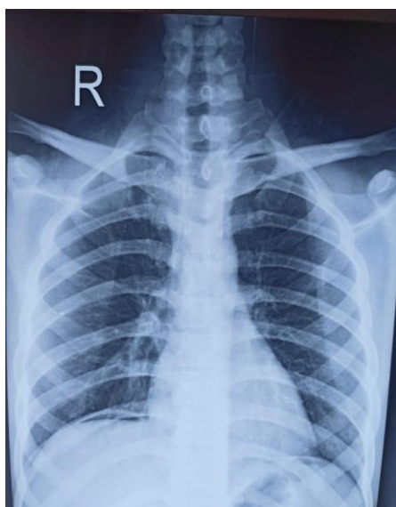
Figure 1: Plain chest X-ray in erect position showing crescentic gas shadow below the right dome of diaphragm.

Both the perforation site and enterotomy site were repaired primarily and closed. The patient was kept on intravenous antibiotics till fifth postoperative day. He was allowed to take oral sips on third post-operative day. He passed motion on the fourth post-operative day. He was discharged on the sixth post-operative day when he was tolerating oral feeds and had no complaints. Psychiatric consultation was also arranged for the patient. On follow-up after one week the patient had no complaints, the surgical wound site had healed properly with no complications.