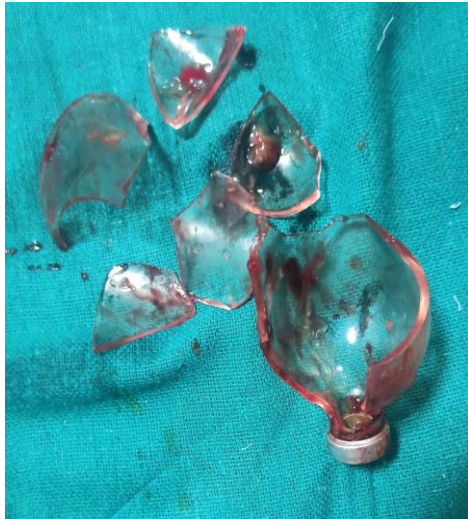
Figure 5: Retrieved foreign body, broken drug vial, which caused the rectal perforation.