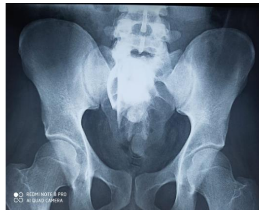
Figure 3: X-ray bilateral hip with pelvis showing location of the foreign body.