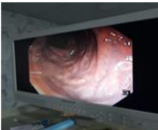
Figure 2: Lower endoscopy of healing of the traumatic distal repair.