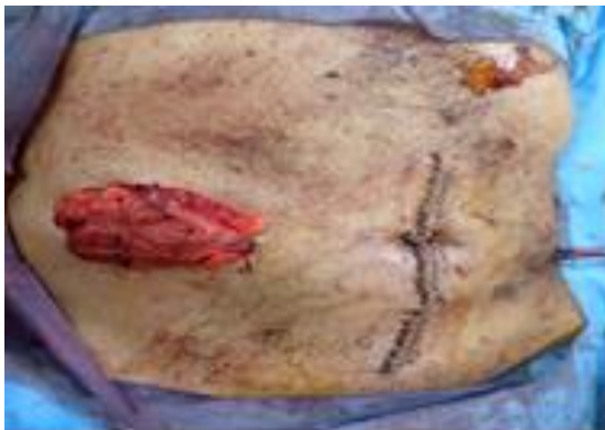
Figure 1: Covering transverse colostomy.

The mean length of hospital stay was ( 15.70 \pm 2.13 days.). There was no relation between length of hospital stay and stoma type (Table 5).