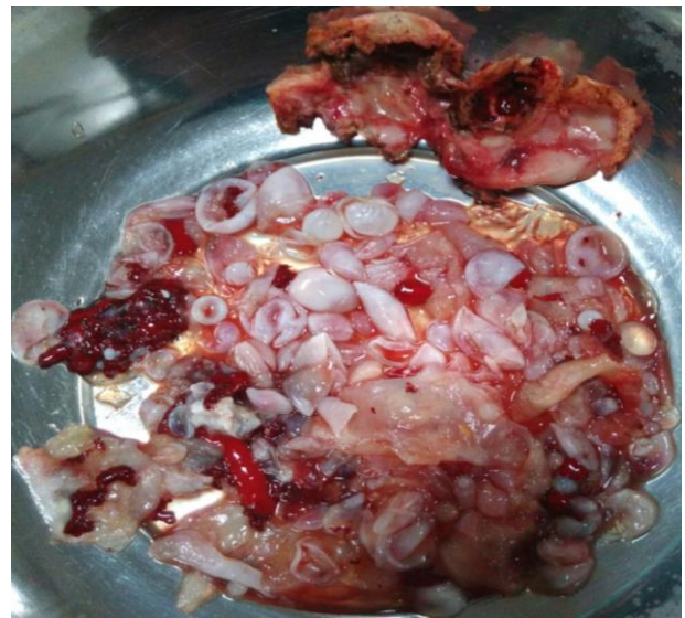
Figure 3: Evacuated contents of the hydatid cyst (daughter cysts).

A diagnosis of hydatid disease was made and oral albendazole, 200 mg BD was started for 14 days before the operative procedure was undertaken. Under general anesthesia, left thoracoabdominal incision was given. Per-operatively a huge saccular aneurysm (25×15 cm) was found to be arising from the descending thoracic aorta, 10 cm above the diaphragmatic opening. Diaphragm was divided circumferentially around the cyst, proximal and distal control of aorta was achieved, cystic wall of the hydatid pseudo-aneurysm was incised and hypertonic saline was first used as a solicialidal agent. Contents were evacuated meticulously to avoid any anaphylactic reaction and wall of the cyst was excised (Figure 3).