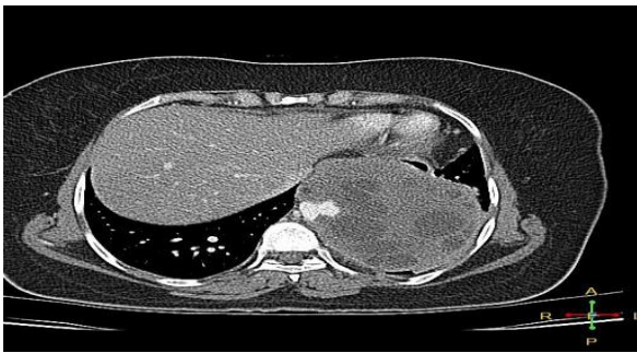
Figure 1: CT scan (axial view) showing multi-locular cystic lesion in the left sub-phrenic retro-crural region displacing the diaphragm anterosuperiorly. Also, few intra-parenchymal atelectatic bands seen displacing stomach anteriorly and abutting the inferior surface of left lobe of the liver.

Computed tomographic thoraco-abdominal scan was done which showed a large well defined multi-locular cystic lesion measuring 12.5×9.2×11 cm (CC×TR×AP) in the left sub-phrenic retro-crural region displacing the diaphragm antero-superiorly causing reduced left lung volume, displacing the stomach anteriorly and abutting the inferior surface of left lobe of liver. Descending thoracic aorta showed tortuous course due to mass effect of the cystic lesion partially encasing the descending aorta with a contrast filled blind ending out-pouching measuring 16×21 mm extending into mass lesion. Abdominal aorta also showed a kink just below the origin of aneurysmal sac causing focal narrowing (measuring 7 mm) at the level of T9 vertebra (Figure 1 and 2).