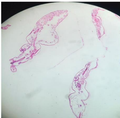
Figure 2: Whole worms.