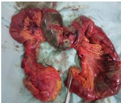
Figure 1: Gross specimen showing congested, thinned out and gangrenous bowel wall.