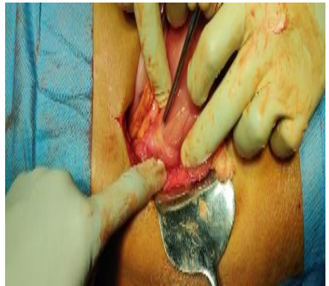
Figure 4: Chronic cicatrised duodenal ulcer (D1).