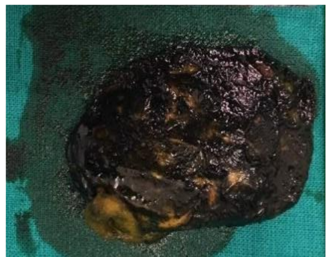
Figure 5: Post-operative phytobezoar specimen.