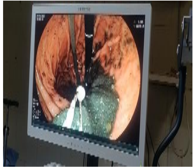
Figure 3: Phytobezoar in D1-duodenum.