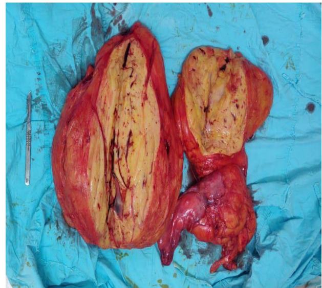
Figure 2: Gross and cut section specimen giant retroperitoneal lipoma.

discussion and evaluation, exploratory laparotomy was planned and performed with aim to either dissect whole tumour or at least debulk the tumour to relieve patient's discomforting symptoms. Intraoperative, we came across two giant retroperitoneal fat tissue masses. One was occupying whole of the right upper and lower quadrants of the abdomen, pushing all the hollow visceral organs, pancreas, right kidney and right ureter to the left and another mass occupying the left retroperitoneal region. Adhesiolysis was done from retroperitoneal soft tissue fat. Feeding vessels identified and ligated. En-bloc dissection was done without injury to other structures and an intra-abdominal drain was put in situ for postoperative vigilance.