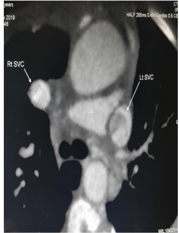
Figure 1: Scan showing patent LPA restenosis after first surgery.

Detached MPA segment swung cranially and anastomosed (Figure 2) to LPA end to end inferiorly and LSV-LPA anastomosed superiorly onto this by end to side fashion using 7-0 polypropylene sutures (Kawashima procedure). Child was doing well at 6 months follow up, CT showed (Figure 3) good flow in the LPA and Kawashima shunt.