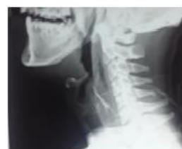
Figure 2: X-ray ST neck lateral view showing irregular sharp radioopaque FB shadow at cervical 4,5,6 vertebrae.

Most of the foreign bodies were detected by plain X-ray chest AP and soft tissue neck lateral view (Figure 2). X-ray barium swallow was used for radiolucent vegetative foreign bodies, plastic objects and mutton piece without bone.