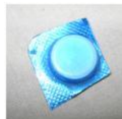
Figure 4: Showing tablet with sharp packing removed from pyriform fossa of a 6 month old child by direct laryngoscopy.

In our series all foreign bodies were removed by endoscopy under general anesthesia. Most foreign body were removed by rigid esophagoscopy [218 (95.61%)] and rest were managed by direct laryngoscopic removal. (Figure 4).