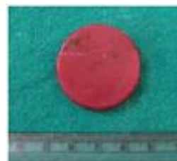
Figure 1: Showing large atraumatic plastic cap removed from oesophagus.

therefore they were considered for emergent removal (Table 2).