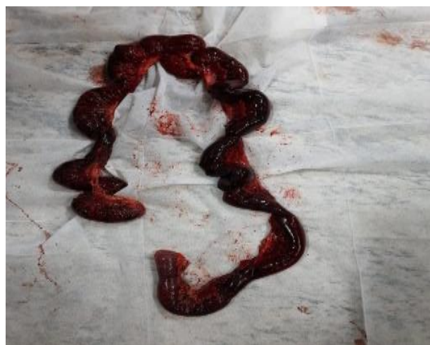
Figure 3: Resected gangrenous ileal segment.