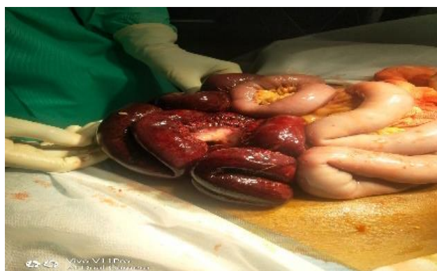
Figure 2: Gangrenous ileal segment (intra-operative image).