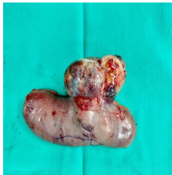
Figure 5: Resected specimen.