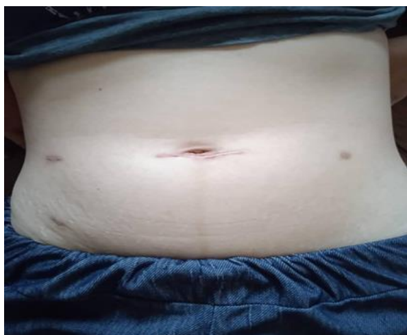
Figure 6: Post-operative review of wounds.