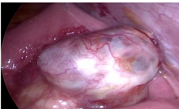
Figure 2: Exophytic jejunal tumor with marionette stitch in place.