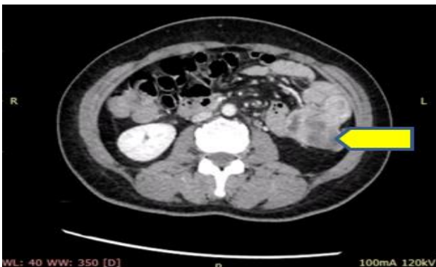
Figure 1: Mid jejunal tumor (yellow arrow).