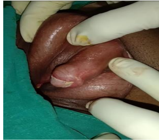
Figure 2: Mons pubis.