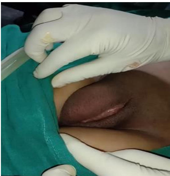
Figure 1: Female external genitalia.