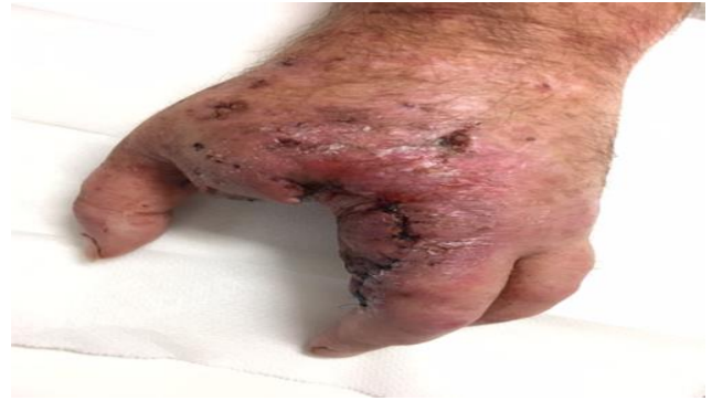
Figure 3: Six weeks post-operative showing dorsal aspect of hand and flap repair.

Following routine discharge, the post-operative period was complicated by cellulitis of the left hand that required intravenous (IV) antibiotics and hypernatremia, both of which were treated in the same hospital admission. The histopathology revealed negative margins. After 6 weeks, the patient's flap has healed over 90% (Figure 3) and he has begun full range of motion activities but continues to splint the hand at night.