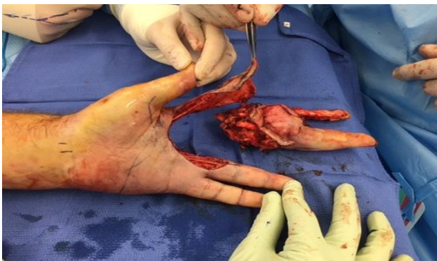
Figure 2: Intraoperative image following amputation, with amputated specimen.

Following routine discharge, the post-operative period was complicated by cellulitis of the left hand that required intravenous (IV) antibiotics and hypernatremia, both of which were treated in the same hospital admission. The histopathology revealed negative margins. After 6 weeks, the patient's flap has healed over 90% (Figure 3) and he has begun full range of motion activities but continues to splint the hand at night.