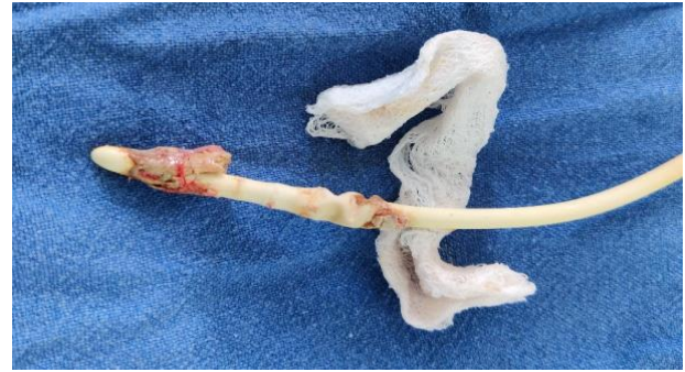
Figure 4: Foleys removed intact after fragmentation of encrusted calculi.