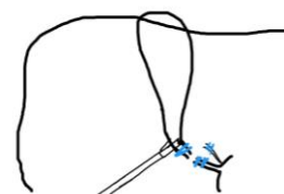
Figure 1: The step of clipping of cystic duct and artery.

Figures 1 to 3 represents the step of dissection of gall bladder from the liver bed.