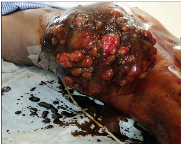
Figure 2: Carcinoma breast mimicking tuberculous mastitis.

Chances of misdiagnosing TB on clinical and radiological features is significantly more in abdominal TB compared to other sites, however the difference was not statistically significant between other sites. Majority of lymph nodal TB patients were diagnosed based on cytological findings (76/127-60%) and extremity bone and joint TB by imaging while other sites it was by HPE of biopsy specimen. Use of FNAC in diagnosing lymph nodal TB being significantly better than in diagnosing TB at other sites. Overall, CBNAAT was significantly better at detecting extra pulmonary TB compared to cytology (p=0.01), AFB on microscopy and AFB Culture (p=0.008) while AFB on microscopy was found to be significantly inferior in detecting the disease when compared to all other methods including imaging, cytology and AFB culture.