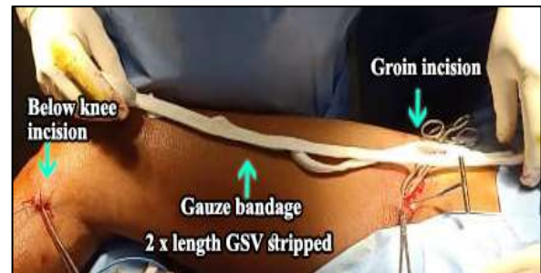
Figure 2: Measuring length of 10 cm gauze bandage.

A 10 cm wide gauze bandage is folded in such a way that the length of the bandage is equivalent to twice the distance between the groin incision and the below knee incision (Figure 2). It is then folded in half, in effect making the bandage equivalent to the length of the GSV being stripped. The gauze piece is then soaked in 1% lidocaine with epinephrine. A number 1 silk is folded four times with one end attached to the gauze bandage and the other end tied securely to the stripper head and proximal GSV (Figure 3).