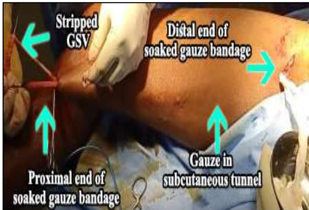
Figure 4: Stripping the GSV along with placing gauze bandage in subcutaneous tunnel.

The GSV is then inverted and stripped from groin to below knee in a steady manner, pulling in the gauze bandage through the subcutaneous tunnel and out through the below knee incision (Figure 4). Leaving the gauze bandage in situ, the groin incision is closed in layers using 2-0 vicryl and 3-0 monocryl. After dealing with the perforators through incisions in pre-operatively marked areas, these incision sites are closed in a single layer using 3-0 monocryl.