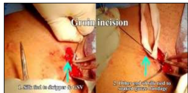
Figure 3: Attaching gauze bandage to GSV and stripper head with silk suture.