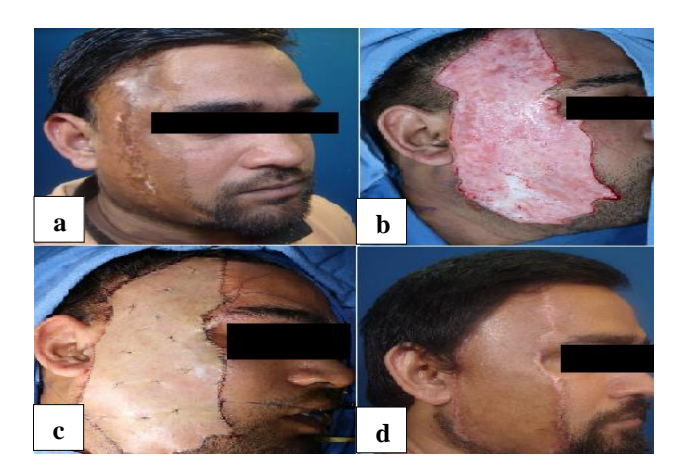
Figure 5: Results of post burn scar right side face – (a) preoperative, (b) intraoperative – post excision of scar, (c) intraoperative – after application of graft, and (d) 4 months post-operative.