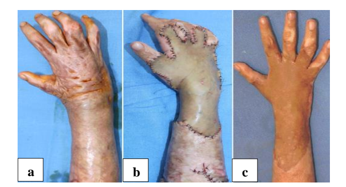
Figure 3: Results of post burn scar right hand (a) preoperative, (b) immediate post-operative and (c) 6 weeks post-operative.

In stage two, EFTSGs was harvested from the expanded region. Total seven EFTSGs were used. Grafts ranging in size from approximately 60 cm<sup>2</sup> to greater than 700 cm<sup>2</sup> were harvested from the expanded donor sites on lower abdomen and lower extremities. Among seven EFTSGs, three were used in upper extremity, one in lower extremity and three in the facial reconstruction. One patient underwent reconstruction of the post burn scar of the right upper and lower extremity with EFTSGs in two different sittings. The donor site was closed primarily in all cases. Post-operatively partial skin necrosis of approximately 6 cm<sup>2</sup> in dimension was noted in the leg (recipient site of expanded FTSG) of one patient which later healed with debridement and regular dressings. In all other cases the EFTSGs take was good (Figure 3-5).